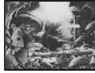
Trip To the Moon by George Mèliès 1902