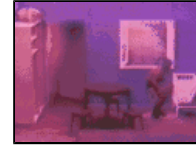
Tango by Zbigniew Rybczynski 198